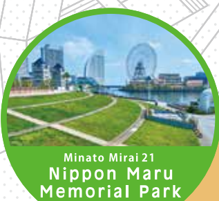
Minato Mirai 21 Nippon Maru Memorial Park