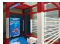
Gantry crane simulator