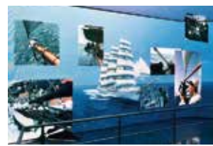
VR Theater "Minato Capsule"

Yokohama Port Museum re-opened after renovation in June 2022. Under the theme of "Port of Yokohama in history and life" , the exhibits focus on the history, operation and role of the Port of Yokohama. In the history zone, we will look back on the history of Yokohama Port for about 160 years since around the opening of the port. In the rediscovery zone, the VR Theater, a new interactive content, allows visitors to enjoy the exhibition sails of the Nippon Maru and the cruise ship's journey through images. You can also experience loading and unloading containers in the gantry crane simulator. The Museum also provides special exhibition, lectures, and the other events.