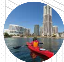
Sea kayaking class