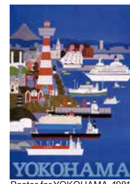
Poster for YOKOHAMA, 1981