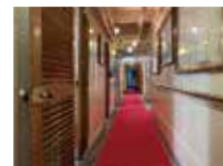
Corridor in the ship