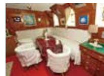
Captain's public room