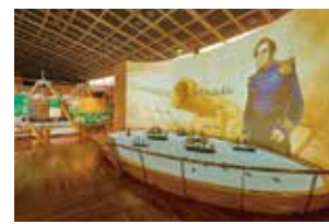
Video Exhibition "Perry Expedition"